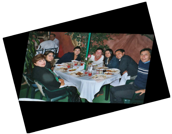
Living in Turkish host families, families of the students from high schools to see turkish culture better, deeper.