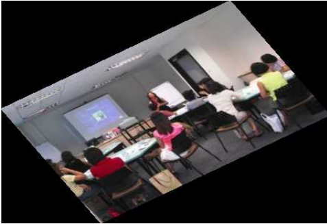
Weekly meetings in each LC to evaluate the Project and satisfaction of interns.