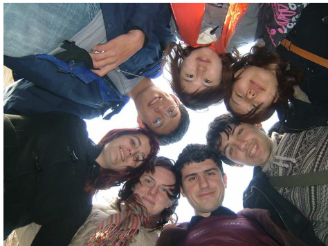
Opening seminar in the beginning of the Project in Istanbul, hosted by MC Turkey for preparations of interns and giving information about Project, Turkish culture, Turkish education system.